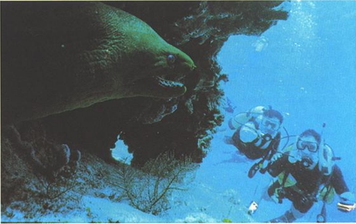
TWO DIVERS ENCOUNTER A GREEN MORAY EEL BENEATH A LIMESTONE LEDGE.

This palm forest draped with lush ferns and vines receives daily showers and downpours. Bromelads cling to branches and harbor a vast variety of tree frogs. Amongst the palms grow 225 species of trees, 88 of which are quite rare, and 23 of these grow nowhere else in the world. There are also 50 species of orchids and 68 species of birds which thrive under this jungle canopy. Eco-tourists can easily and safely transit these exotic jungle trails, due to the continual management by the U.S. Forestry Service.